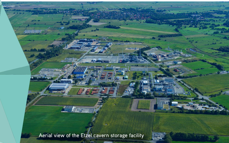
Aerial view of the Etzel cavern storage facility